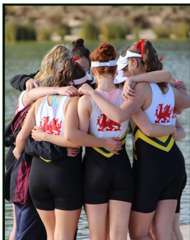
Crew huddle 2015

1990 1991 1992 1993 1994 1995 1997 1999 2001 2005 2006 2007 2009 2010