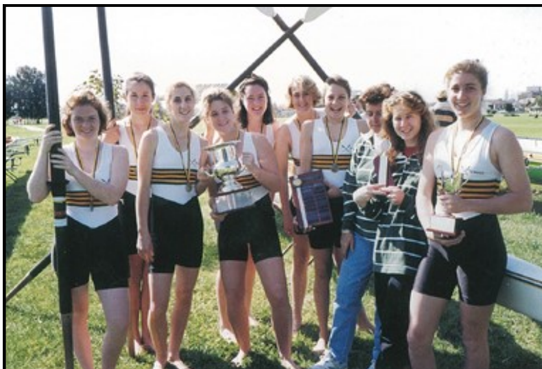
1991 Schoolgirl Premiers & 1st VIII+ Winners