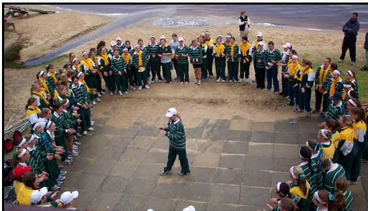
A crew huddle in front of the Shed 2003

In 1992 the Canning Bridge Shed was completed and for the next 25 years became home to Penrhos Rowing.