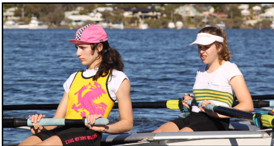
Training on the Canning River 2012. Each year Senior Squad members design their own piece of training clothing (zoot suit at left)