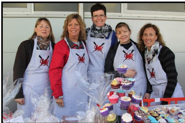
Penrhos Rowing Support Group 2012