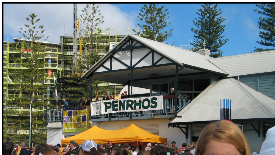
Head of the River Day 2003